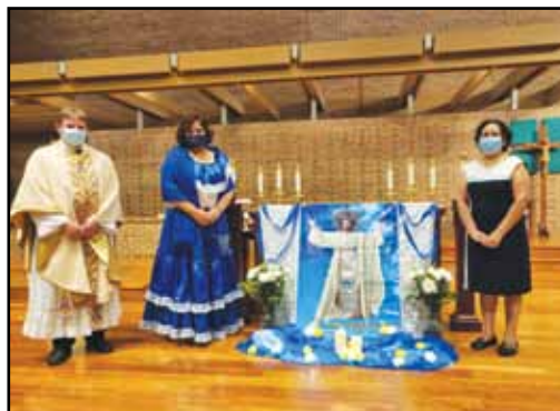
August 2020: Celebration of Jesus, Savior of the World.