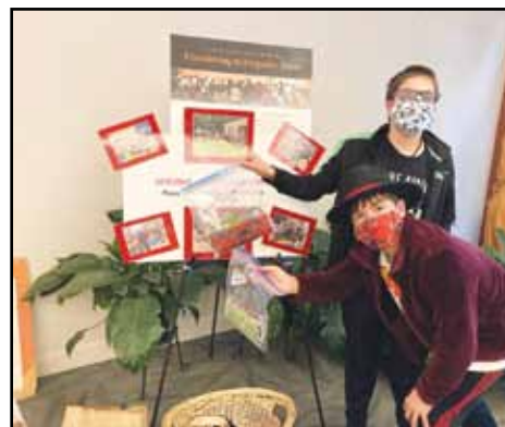
Teens made masks to donate to local shelters as part of a service project during the Summer.