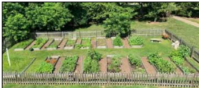
During the summer, the GS Parents Group continued to tend the Sharing Garden