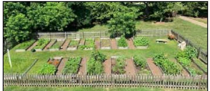
During the summer, the GS Parents Group continued to tend the Sharing Garden