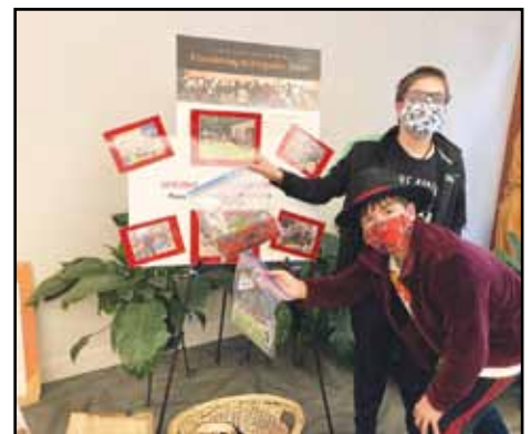
Teens made masks to donate to local shelters as part of a service project during the Summer.