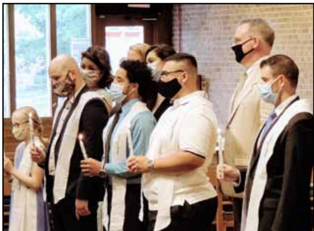
June 2020: Parish life resumes! Sacraments of Initiation delayed at Easter now being celebrated.