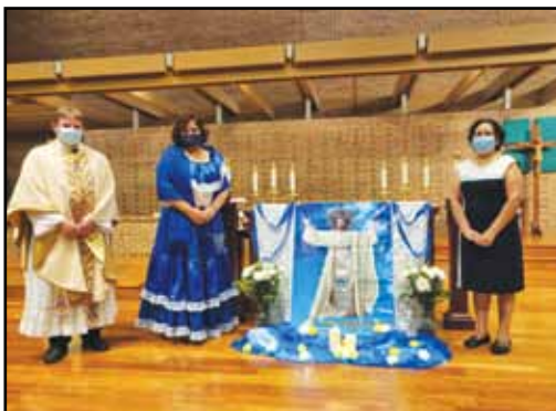
August 2020: Celebration of Jesus, Savior of the World.