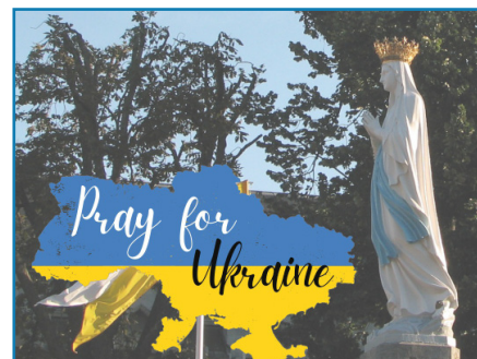
On the Solemnity of the Annunciation, Pope Francis consecrates Russia and Ukraine in particular, to the Immaculate Heart of Mary.