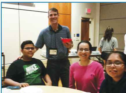
Our fellowship events are in full swing! Coffee and donuts, Knights of Columbus’ Pancakes, Mardi Gras, Parish Mission and more!