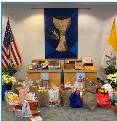
2022 is the Year of the Eucharist