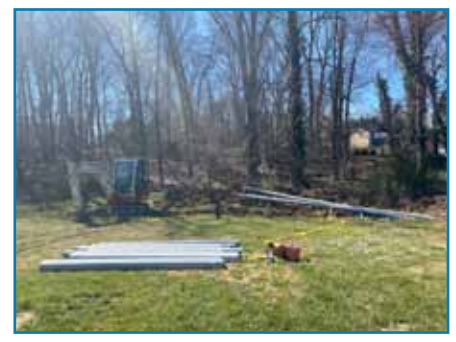
Utility work began in the back of the building