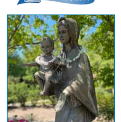
2023 is the Year of Mary As we prepare to mark our first half-century, the Catholic Diocese of Arlington is embarking on a spiritual and intellectual renewal in the foundational truths of the Catholic Faith. Preparation Year II focuses on Mary, the Mediatrix of All Grace and the model disciple.