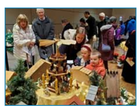
We celebrated the end of the Christmas season with our annual Crèche Exhibit