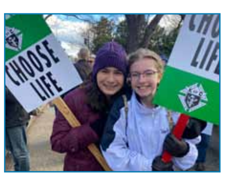
Teens participated in the March for Life in Washington, D.C.