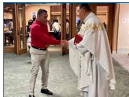
Daily Mass in Spanish now every day, 7pm