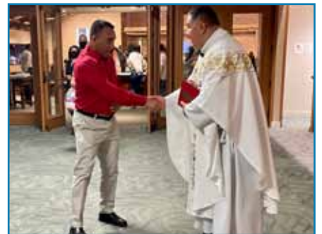
Daily Mass in Spanish now every day, 7pm