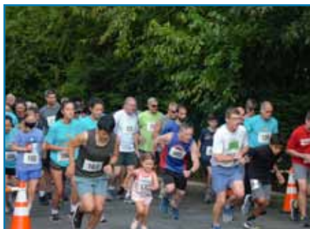
The 5K Race 1 mile Fun Run was a huge success, bringing lots of runners for fun and charity!