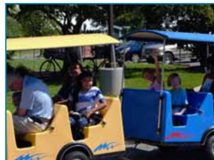
International Festival was in person – not virtual! – and once again a three-day event!