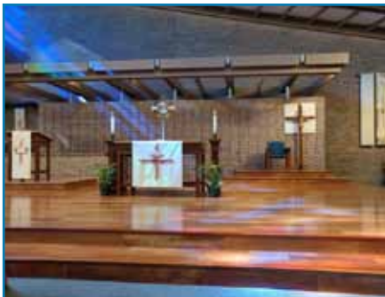
Eucharistic Adoration twice each day (Monday-Friday)