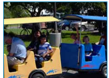
International Festival was in person – not virtual! – and once again a three-day event!