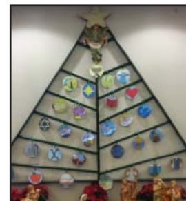
Parish Jesse Tree, 2016