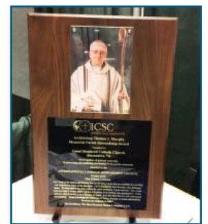
Thomas J. Murphy Award