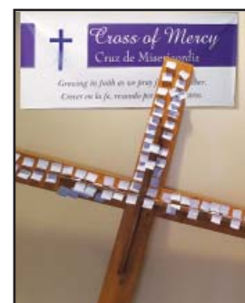
Cross of Mercy