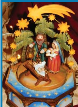
Epiphany Creche Exhibit