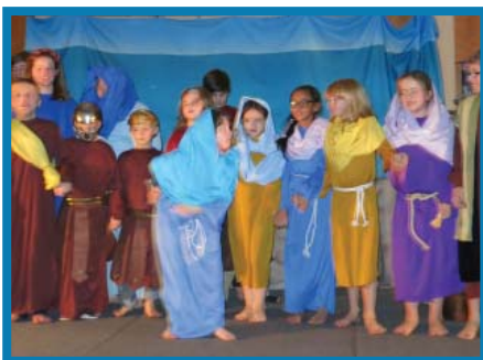
Journey to the Cross, K-6 Students