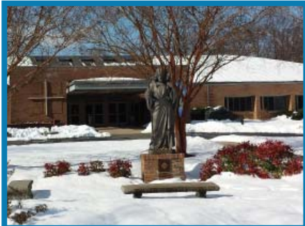
The Blizzard of 2016