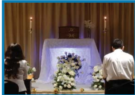
Adoration of the Blessed Sacrament - Holy Thursday