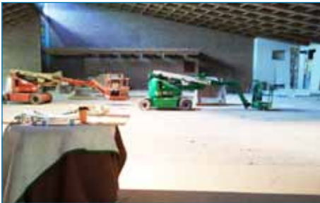
The Church - Before and After