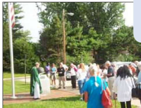
A moment of prayer at the 9/11 Monument