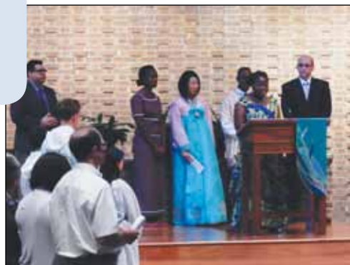
International Festival Mass

"Dear young people, Christ is counting on you to be his friends and witnesses to his infinite love."