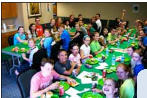
Youth Ministry Kick-Off Party