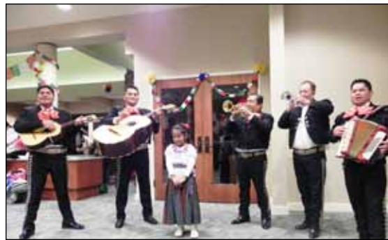
Feast of Our Lady of Guadalupe “Mañanitas” Serenade