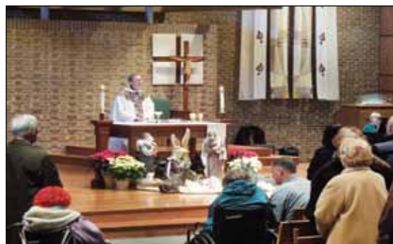
Christmas Day Mass