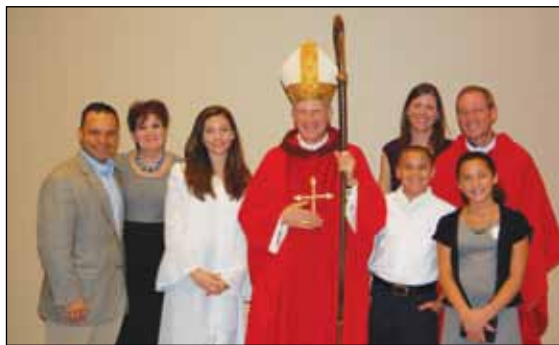
Confirmation - Fall 2013