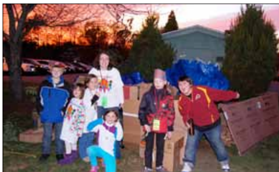
Super Service Saturday - Homeless Campout